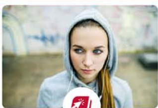
Awareness of Child Sexual Exploitation