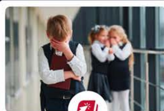
Awareness of Preventing Bullying in Schools