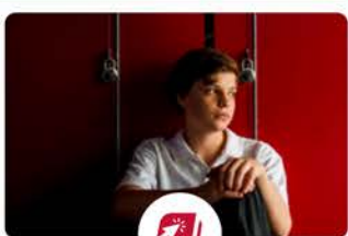
Awareness of Substance Abuse Risks for Schools