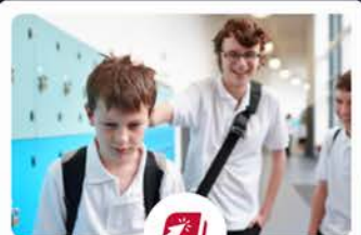
Awareness of Child-on- Child Abuse