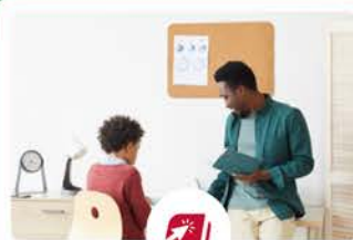
Reflective Safeguarding Practice in Schools