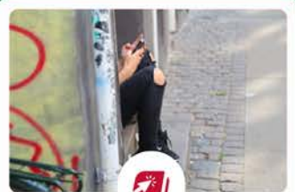
Awareness of Child Criminal Exploitation inc. Drug and County Lines