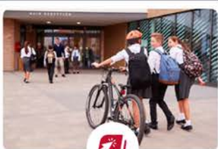
Advanced Safeguarding, Child Protection and Prevention