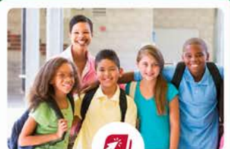
Awareness of Effective Cover Supervision