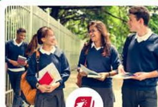
Awareness of Equality, Diversity and Inclusion within an Educational Setting