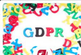
Awareness for staff of GDPR