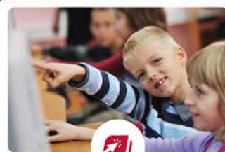
Awareness of Online and E-Safety for Teachers & Staff